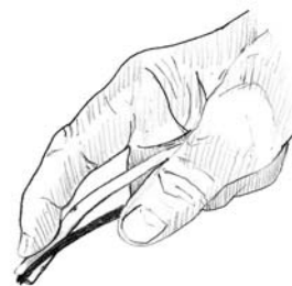
Fig. 2 Hemostat and Hand Position